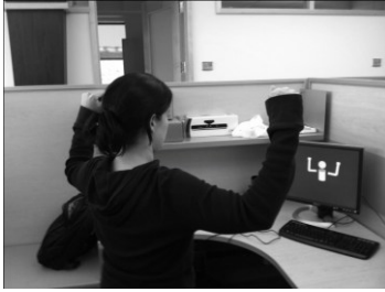
Fig 3. Position required for camera to track user

Feedback from clinicians was supportive of the development of a flexible system that provides the option to tailor the game-based task to the user. Clinicians liked the option to change the avatar view from skeleton to hand only views. Changing the appearance of the avatar, whilst still tracking the skeleton, allows the clinician to remove visual feedback provided to the patient. Removing this external feedback, encourages the patient to rely on internal sensory-perceptual information to control their movement [17]. Providing less visual feedback about the player's movement increases the level of difficulty and this was supported in the participant's unanimous choice of the skeleton avatar as the easiest to understand and use. However, the use of the hands only avatar representation is important progression in therapy guided by motor learning principles [17].