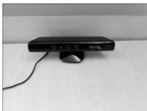
Fig 1. Microsoft Kinect sensor

This revolutionary game platform uses an infrared depth-sensing camera (produced by an Israeli company, PrimeSense) to capture users' full body movement in 3D space for interaction within game activities. This system does not require the user to hold an interface device or move on a pad as the source of interaction within the game. Instead, the user's body is the game controller operating in 3D space and multiple users can be tracked. The camera connects to PC using USB. The technology behind PrimeSense is used in the commercially available Microsoft Kinect sensor (Fig 1). In the current prototype, the Microsoft Kinect sensor is connected to PC through USB.